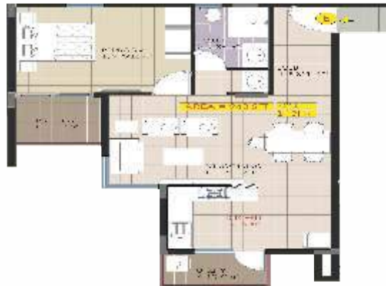
Block- 7,8 & 9, Area- 943 sq.ft