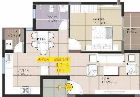
Block- 2, Area- 868 sq.ft