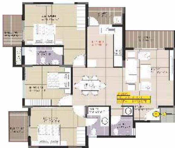
Block- 5 & 6, Area- 1633 sq.ft