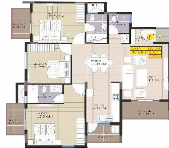
Block- 5, Area- 1639 sq.ft