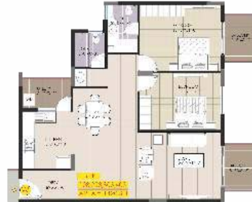
Block- 2, Area- 1420 sq.ft