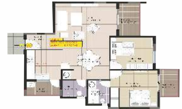
Block- 5,& 6, Area- 1270 sq.ft