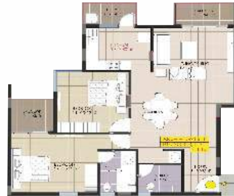
Block- 7,8 & 9, Area- 1364 sq.ft