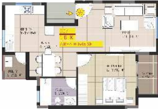
Block- 2, Area- 886 sq.ft