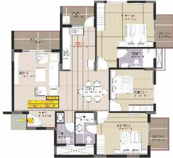
Block- 5, Area- 1629 sq.ft