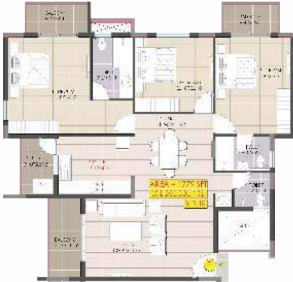
Block- 1, Area- 1779 sq.ft