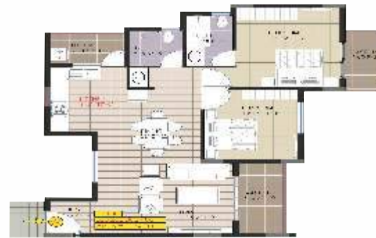
Block- 5,& 6, Area- 1234 sq.ft