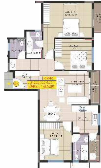
Block- 3, Area- 1480 sq.ft