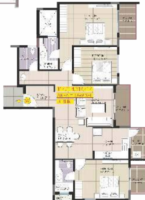
Block- 2, Area- 1649 sq.ft