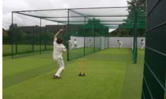
Cricket Practice Net