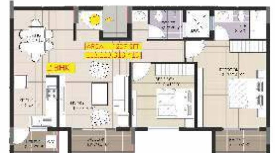
Block- 2, Area- 1207 sq.ft